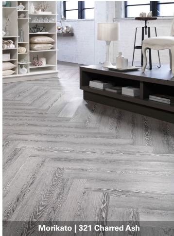
Morikato | 321 Charred Ash

Access the world through Mohawk Group's premier collection of commercial luxury vinyl tile: Global Entry. Antiek and Morikato travel the globe to bring hardwood species from across the planet in contemporary colors and realistic wood textures. The commercial grade wear layer and M-Force™ Enhanced Urethane ensure these timeless LVT products perform through the life of the installation.